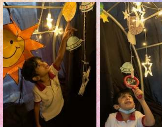
Visit to the NDN Planetarium