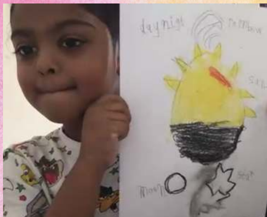
Things I see during the Day and Night