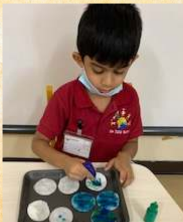
Water Absorption Experiment