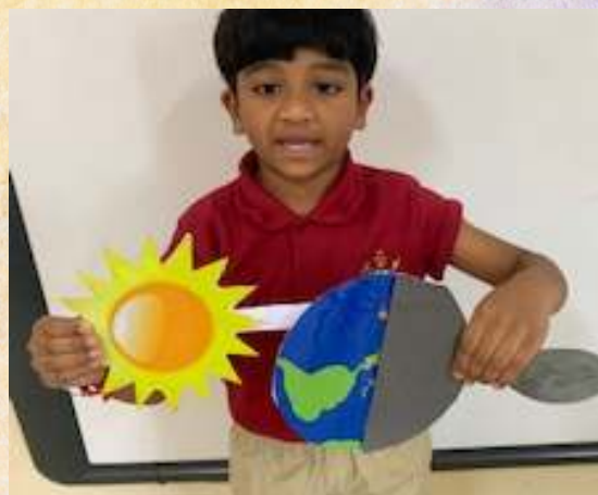
Concept of Day and Night