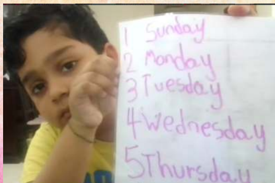
Days of the Week