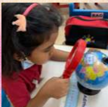
U.A.E on the Globe