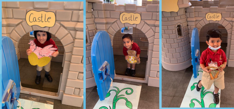
We enjoyed 'The Beanstalk Climb' activity. It was fun climbing the Beanstalk and finding the hidden treasures in the castle.