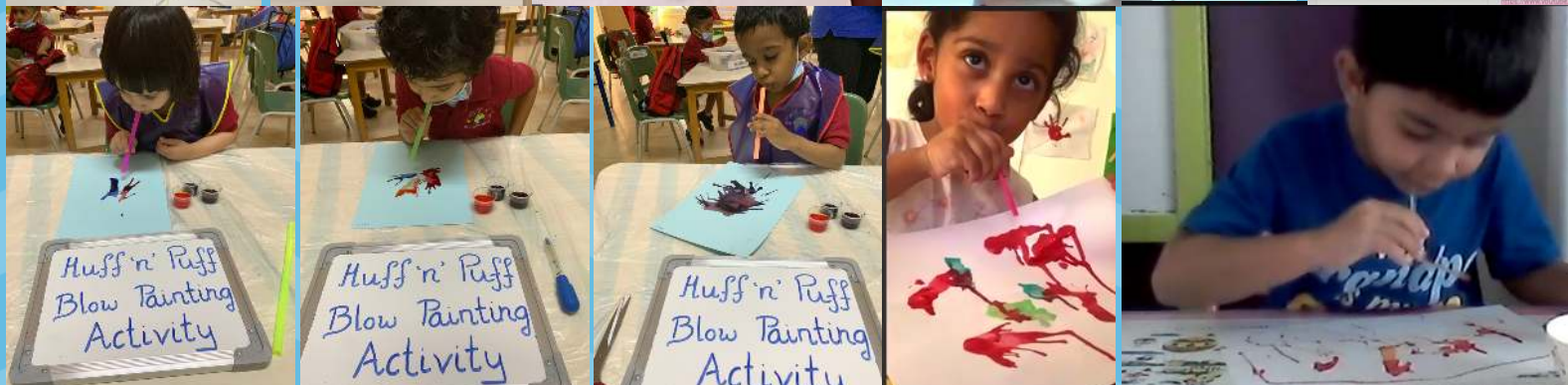
We enjoyed different activities aligned with the story, especially the 'Huff & Puff blow painting activity, where in we all pretended to be the Big Bad Wolf.