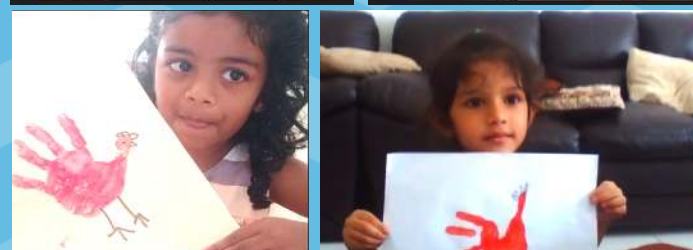
We made our own Little Red Hen with our handprints.